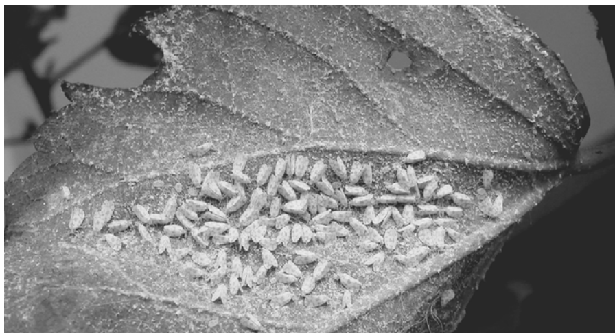
Adults of the giant whitefly

In Asia, the giant whitefly has been reported only from Java, Indonesia since 2008 and its population has remained relatively low. A recent (2011) quick survey and examination of the giant whiteflies in the Bogor area revealed heavy parasitization by a fortuitously introduced parasitoid, Encarsia guadeloupae (Hymenoptera: