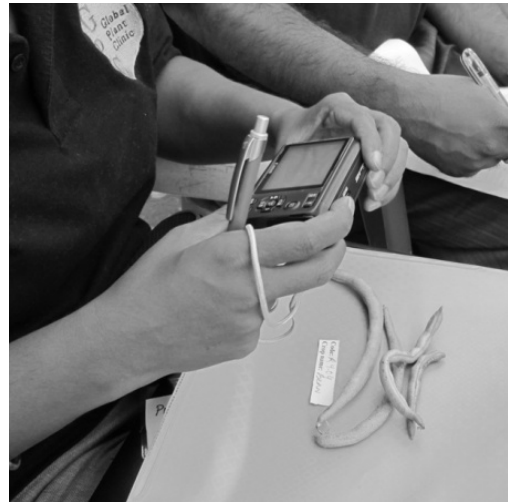
Taking a photo of a sample, including its code number, helps to keep a permanent record

Plant clinics help researchers to learn about farmers' needs (and practical solutions). Head of field