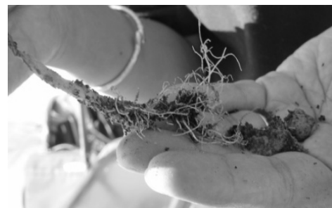
Fungus or bacterium? Taking a sample of a rotten bean plant, with soil, for lab analysis